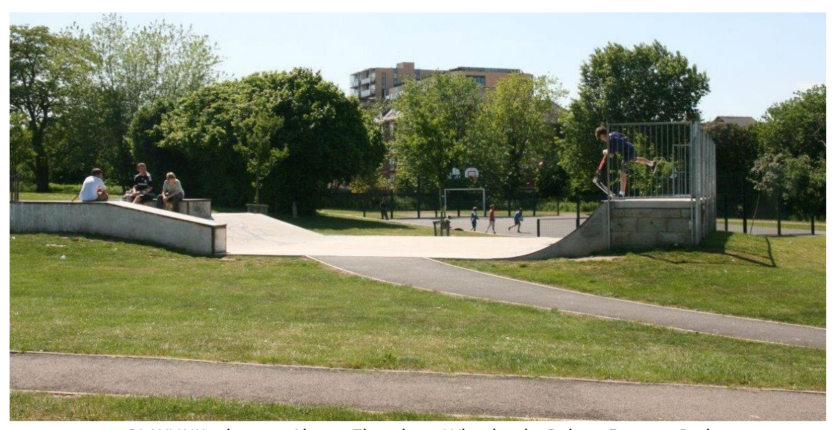
PLAYLINK schemes: Above: Thornbury Wheelpark. Below: Fortress Park.