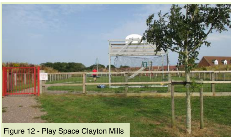
Figure 12 - Play Space Clayton Mills