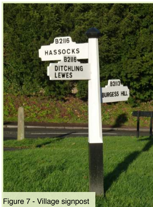
Figure 7 - Village signpost