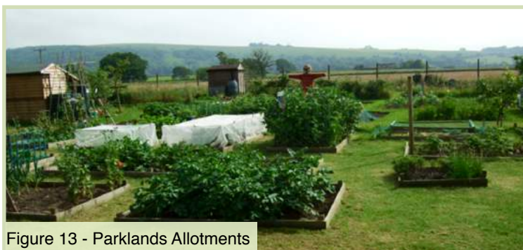
Figure 13 - Parklands Allotments