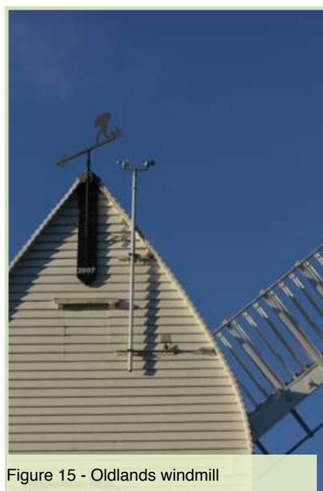
Figure 15 - Oldlands windmill