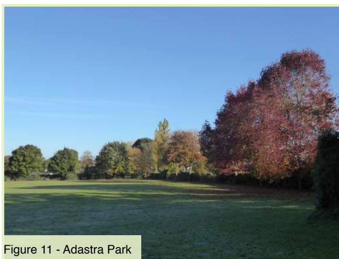
Figure 11 - Adastra Park