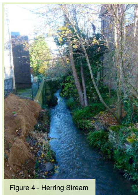
Figure 4 - Herring Stream