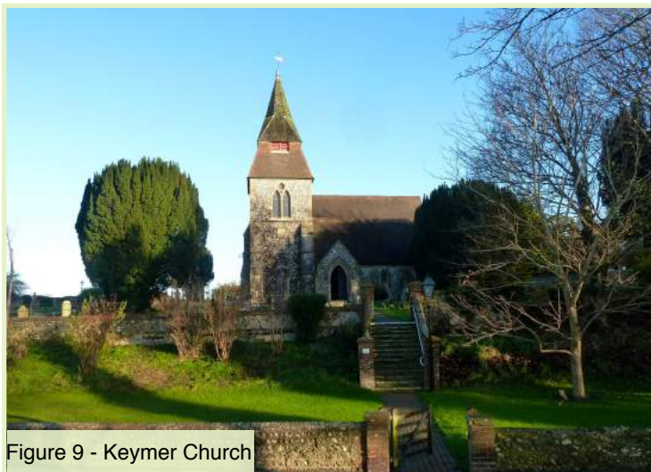
Figure 9 - Keymer Church