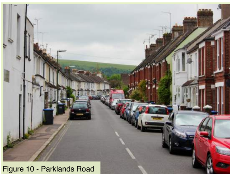
Figure 10 - Parklands Road