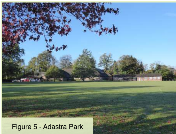
Figure 5 - Adastra Park