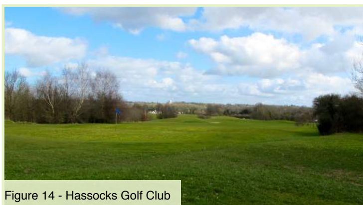
Figure 14 - Hassocks Golf Club