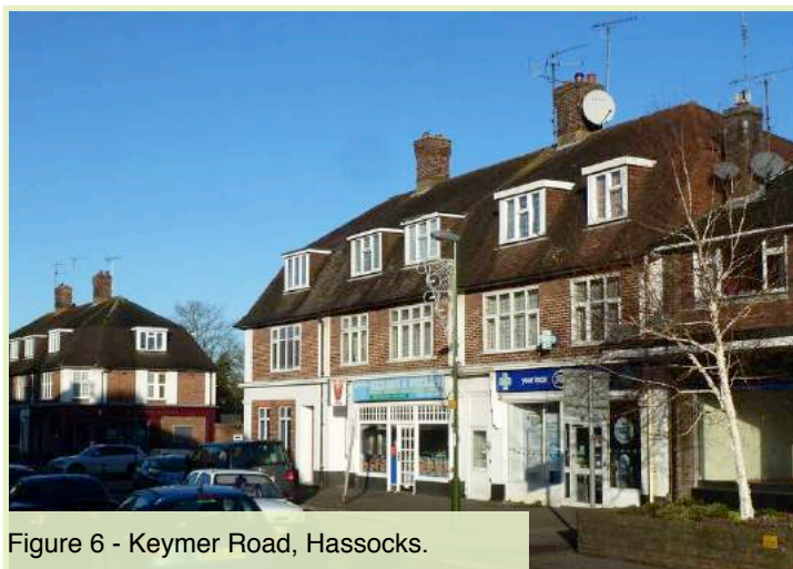
Figure 6 - Keymer Road, Hassocks.