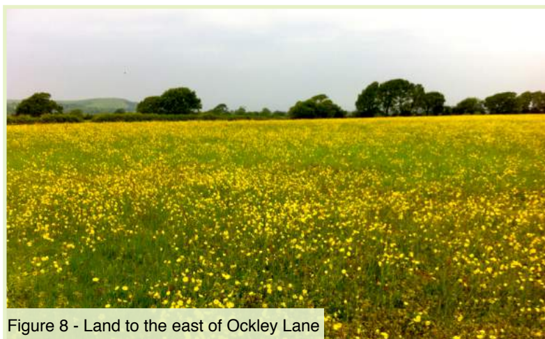
Figure 8 - Land to the east of Ockley Lane